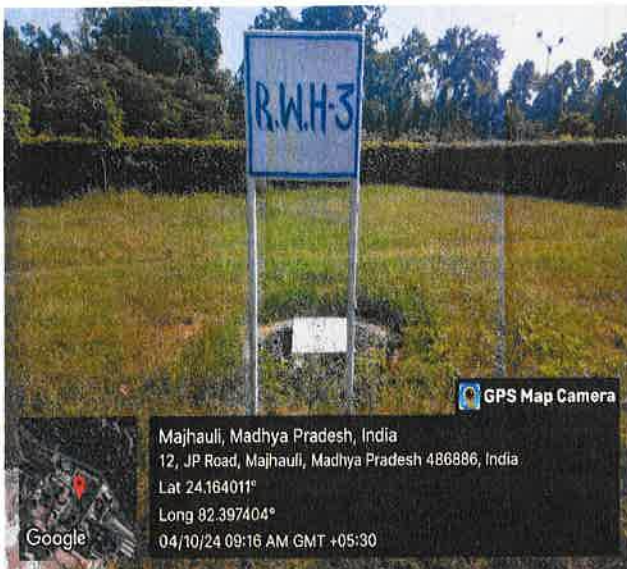
Rain Water Harvesting Pit-03