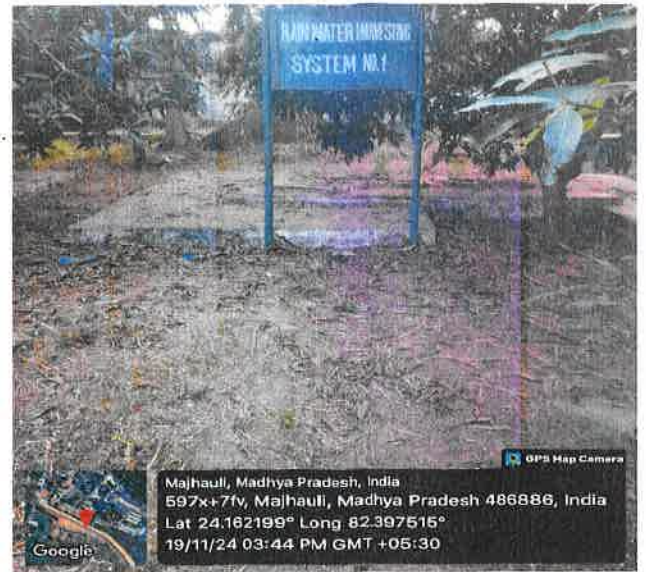
Rain Water Harvesting Pit-02