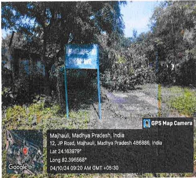
Rain Water Harvesting Pit-01