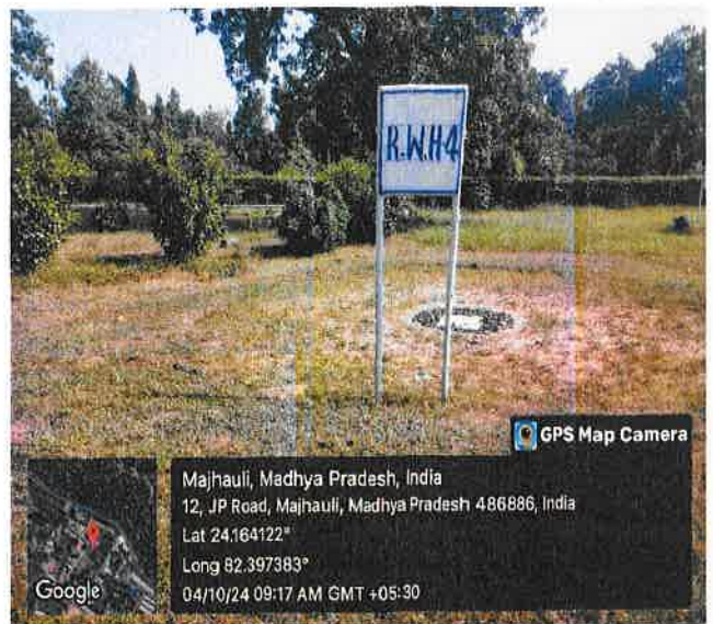
Rain Water Harvesting Pit-04